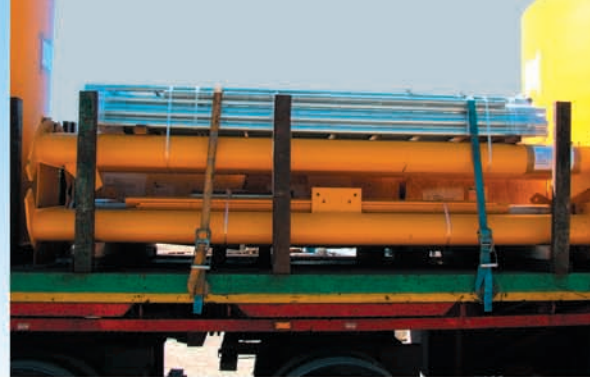
One crane package, one silo.